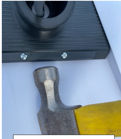
3. Tap GENTLY into place (Only if required)